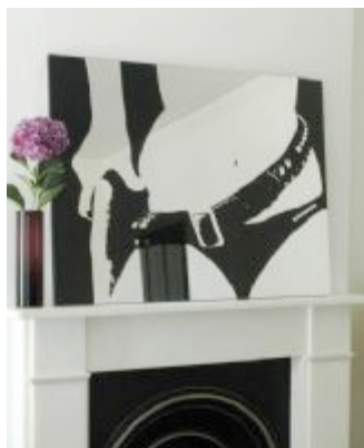
Annie Gunn Mirror